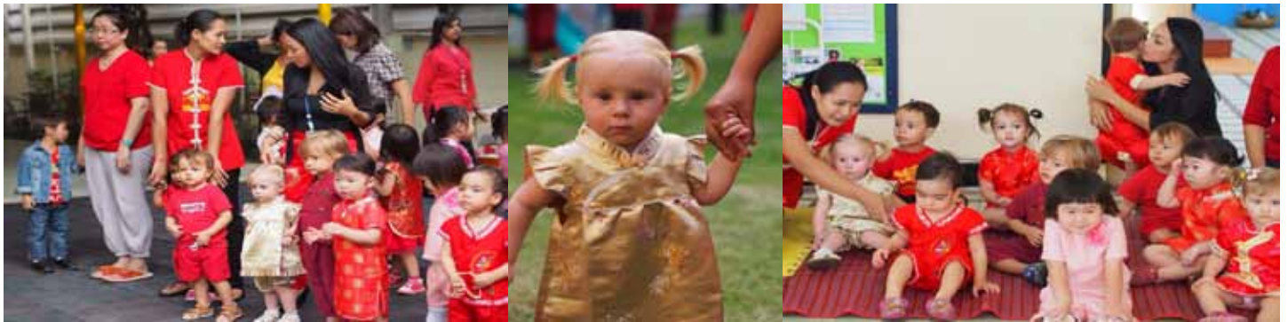
Chinese new year : 8th February 2016 - Children at MMI had a lot of fun getting ready for the parade and sing a song about the year of the Monkey during their small celebration in the morning in front of the parents.