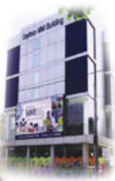
MMI Colombo, Sri Lanka