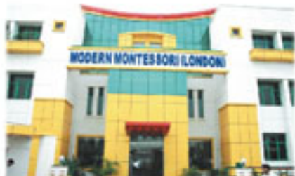
MMI Gurgaon, India