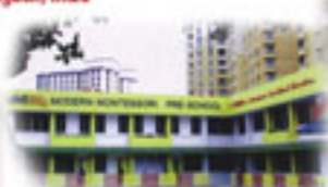
MMI Sengkang, Singapore