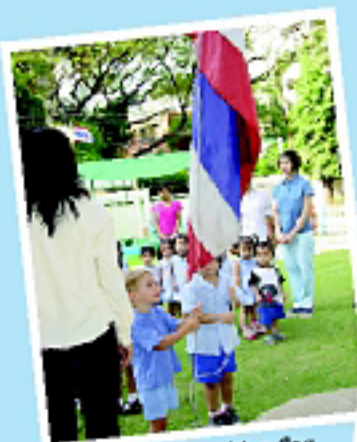
The day starts with a flag raising ceremony.