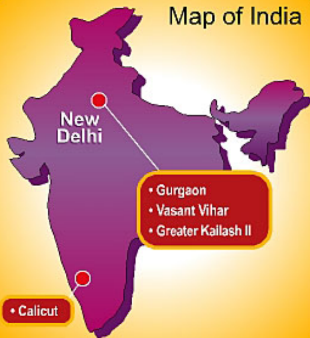
Map of India

The MMI-MES partnership will, no doubt, beget high-quality early childhood programs and top-class education services for both children and their parents.