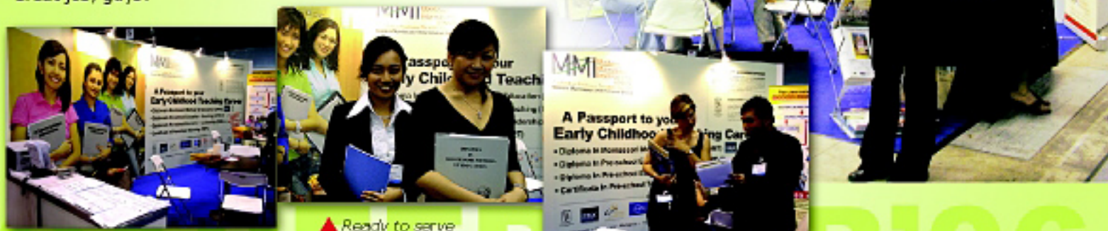
▲ A Class Act