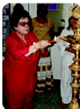
◀ Lighting the lamp at Claymore