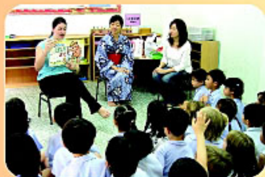
▲ Classes jumpstarted with kamishibai, a Japanese picture card story-telling.

On this bright and cheery morning, children and teachers of MMI Claymore celebrated their Passport to the World - Japan Day. Some Japanese mothers and children arrived garbed in their traditional Japanese summer costumes - namely yukata for moms and jinbei for kids. Domo arigato gozaimashita!