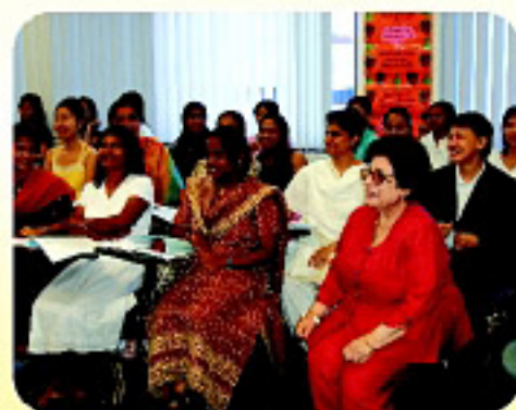
▲ Sitting in One Of The Montessori Classes