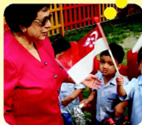
▲ A Warm Welcome