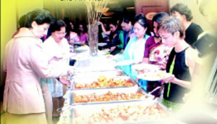
▲ Ladies first.