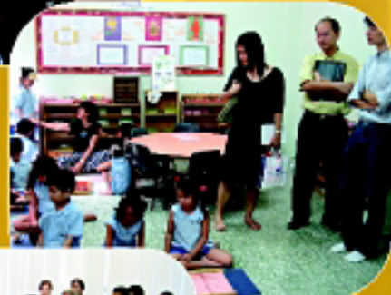
▶ Observing children in action