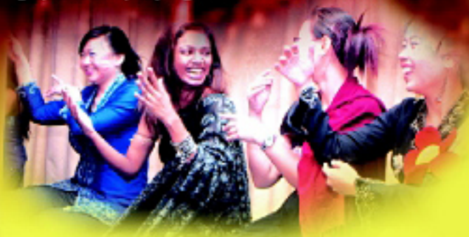
▲ Dikir Barat for the gamely girls.