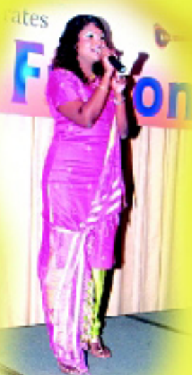
▲ Serenading the audience with a 'minus-one' number.