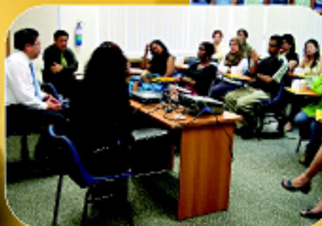
◀ Fielding questions during Q&A session at MMI Headquarters