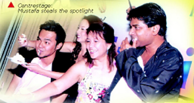
▲ A pie affair