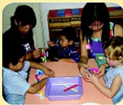
▲ It was proceeded by origami, or Japanese paper craft making.