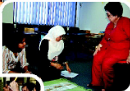
▶ Posing a photo with the Claymore children