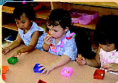
▲ Next up was Japanese snacks of fruit candies, marshmallows and rice crackers.