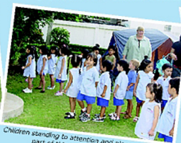
Children standing to attention and pleased just to be part of this important time of day.