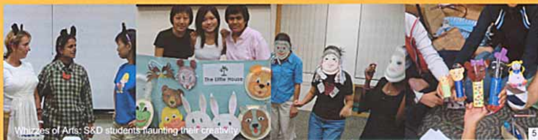
Whizzes of Arts: S&D students flaunting their creativity